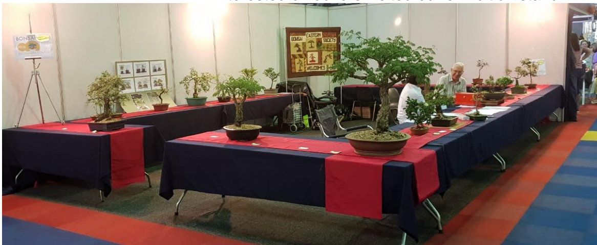
EBS welcomes you