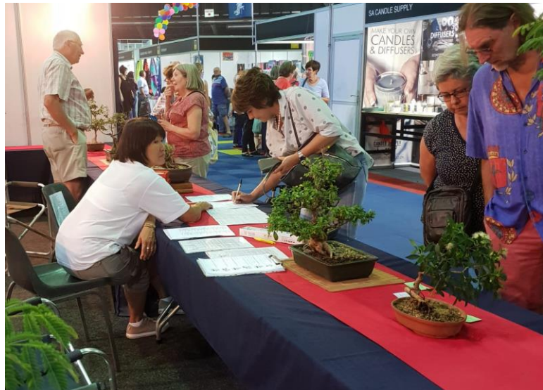
Q&A with the public, selling raffle ticket and many interested onlookers visited our exhibition stand.